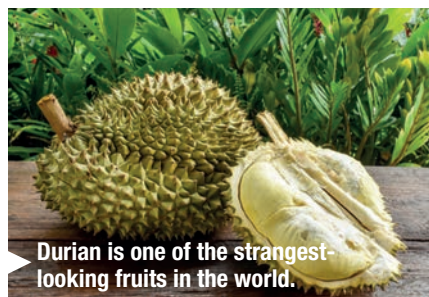
Durian is one of the strangest-looking fruits in the world.

Durian is quite popular in Indonesia, Malaysia, and the Philippines. Personally, I can see why!