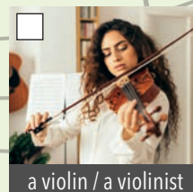
a violin / a violinist

B ▶ 08-02 Listen. What do you hear? Who is playing the instrument? Number the images in 1A.