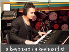
a keyboard / a keyboardist