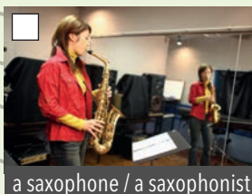
a saxophone / a saxophonist