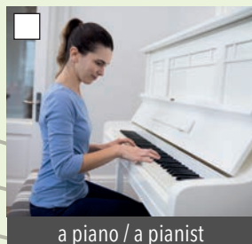
a piano / a pianist