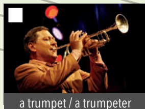
a trumpet / a trumpeter