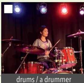
drums / a drummer