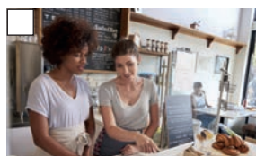
train new employees