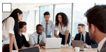
communicate with team members