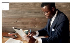
write a report