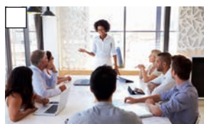
manage a team

A ▶ 10-08 Listen. Then listen and repeat.