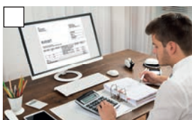
create a budget