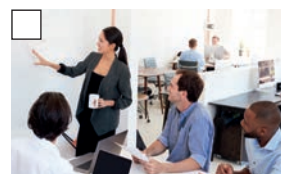
give a presentation