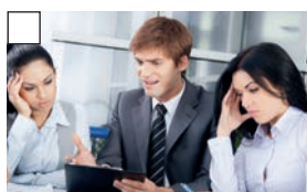
resolve a problem